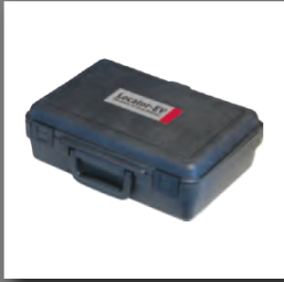
Includes a protective case