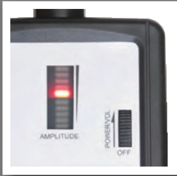
Easy to operate