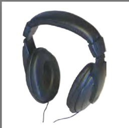
Noise isolating headset