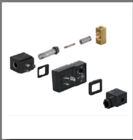
Fully serviceable valve