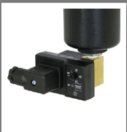
A perfect fit for any filter