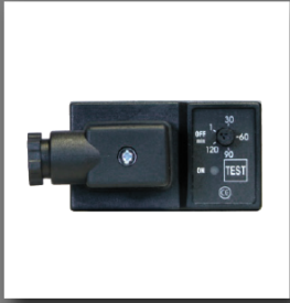
Compact low profile design