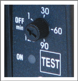
LED lights & test function